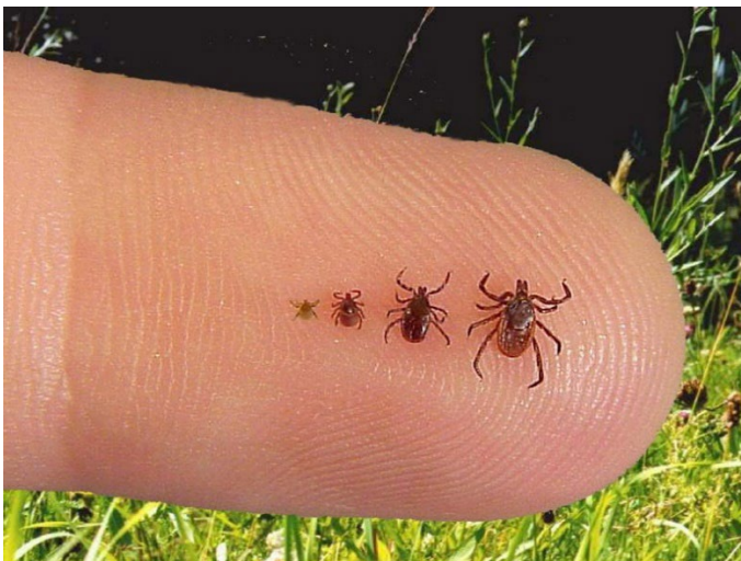
Western black-legged ticks. Pictured from left to right: larvae, nymph, adult male, adult female. (Photo courtesy of CDPH).

Note that a Lyme disease diagnosis cannot be confirmed or out-ruled by the results of a tick test alone. For more information on testing, please contact Mosquito and Vector Control.